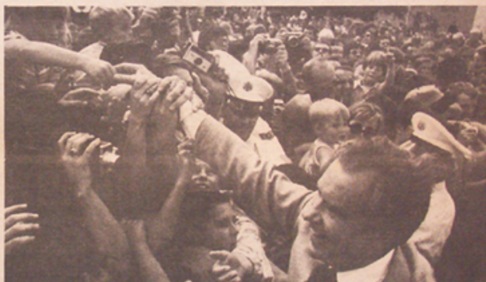
"Will Fascism really come to America? ... the police and the military have begun to arm the children of those who a hundred years ago were American serfs and indentured bond."

Will Fascism really come to America? Will it march in jack boots illuminated by torch light parades? Will it come, as predicted, in the name of "Americanism"? Will the citizens fight it and win like China; fight and lose as in Spain; succumb in the French manner; cheer and be transfigured by it as in Germany? In 1776 a handful, only, rebelled, but they were sufficient. In the 1860s other handfuls would have made history but for the massive Government intervention before the slaves could rise