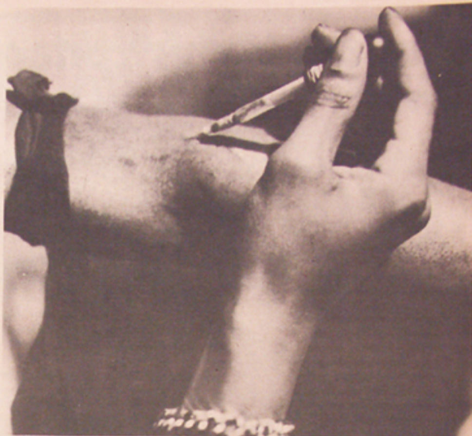
Methadone is a cold-blooded drug pushed by heartless U.S. rulers upon oppressed people as a "cure" for heroin addiction. What will come next when the government decides that it is time for a Methadone addiction program?

"FOR EACH MILLIGRAM OF METHADONE, YOU NEED FOUR MILLIGRAMS OF HEROIN OR MORPHINE TO GET THE SAME EFFECT."