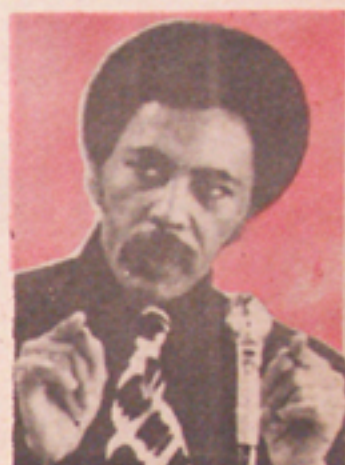
RON DELLUMS CONGRESSMAN, REPRESENTATIVE, 7TH CONGRESSIONAL DISTRICT