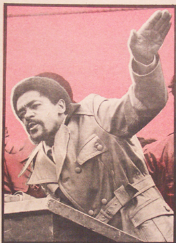
BOBBY SEALE CHAIRMAN BLACK PANTHER PARTY