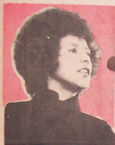
ELAINE BROWN MINISTER OF INFORMATION, BLACK PANTHER PARTY

ANTI-WAR - AFRICAN LIBERATION - VOTER REGISTRATION - SURVIVAL CONFERENCE SPEAKERS: