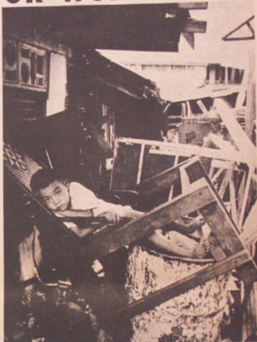
The U.S. Government must bear full responsibility for the devastation and destruction it has caused in Vietnam.

The parties will reach agreement on the forms of respect and international guarantee of the accords that will be concluded.