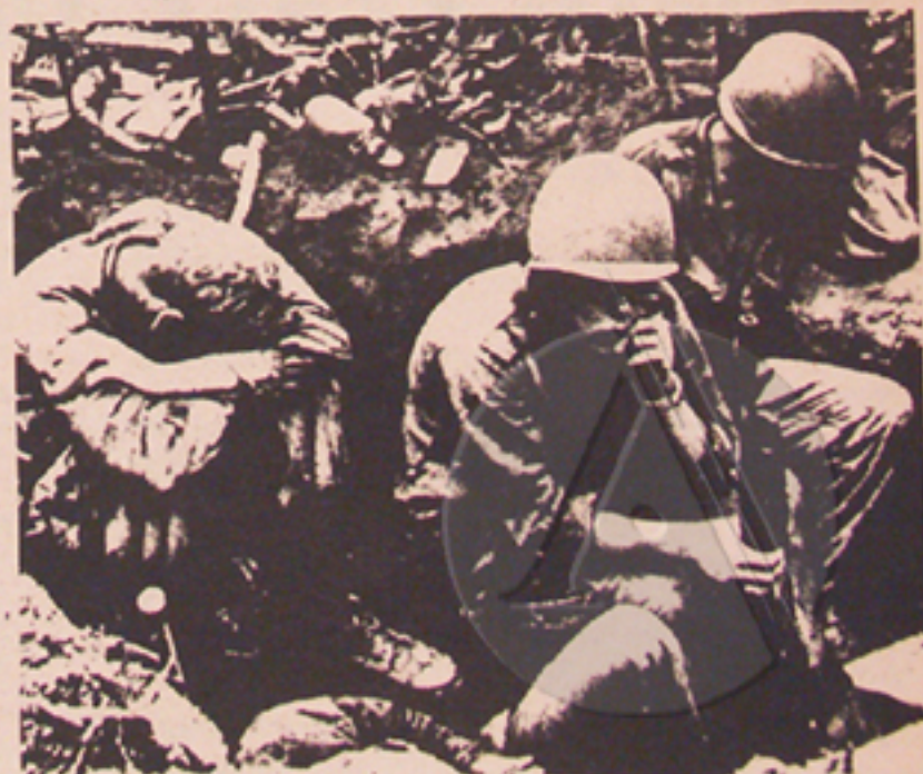
The American ruling class would gladly sacrifice the lives of thousands, even its own, in order to maintain the "prestige of power".