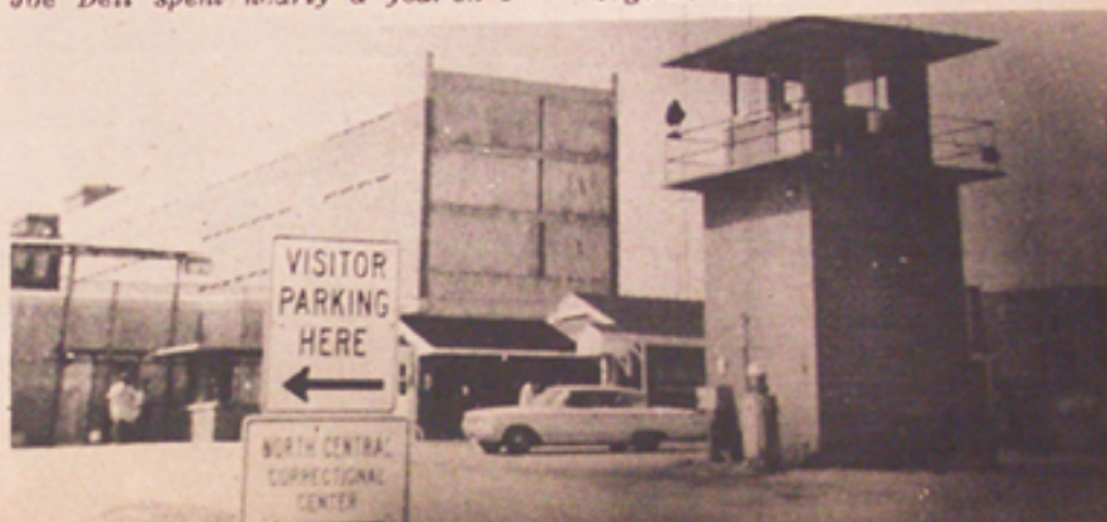
To cover up their murder and render an autopsy impossible, Central Prison fascists even went so far as to remove the vital organs from the body of COMRADE JOE DELL.

When the family went to claim the body, they found that the prison officials had removed all vital body organs. This was done to prevent